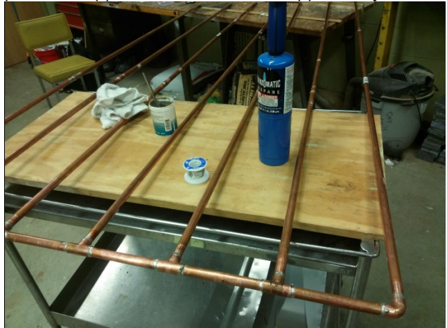
Figure 1: The copper grid built by Tyle L copper tubes.

placed at opposite corners of the copper array.