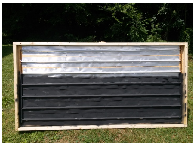
Figure 3: The solar collector

Thin aluminum flashing was cut to the appropriate length: I chose to cut pieces six and a half inch wide, 18 inches long to be situated. I pounded a 5/8 inch steel rod over the aluminum flashing placed over top of a jig that had a groove in it that allowed for the fin to take its shape. The aluminum fins fit tightly over the copper riser tubes to aid in heat transfer. Small 3 inch wide strips were put under as well to maintain an enclosed conducting wall around the copper tube and to retain continuity. Enough were cut to make a cover for each riser tube which in my design used 6 with a slight overlap stretching from one manifold to the other. Once all of the fins have been cut out and pounded into the necessary amount put silicone caulk on the inside of the grove of the fin to minimize the air gap when the fin is stapled to the plywood over the copper tubing. Also, run a small bead of silicone caulk on both sides of the three inch strip to make a more effective heat transfer design because silicone is better at conducting heat than air. Keep pressure on the fins when securing them to the copper tubes with staples. Be sure to use stainless steel staples. Rustoleum high heat black paint was used to coat the inside of the solar collector to help absorb solar radiation. Multiple coats were done.