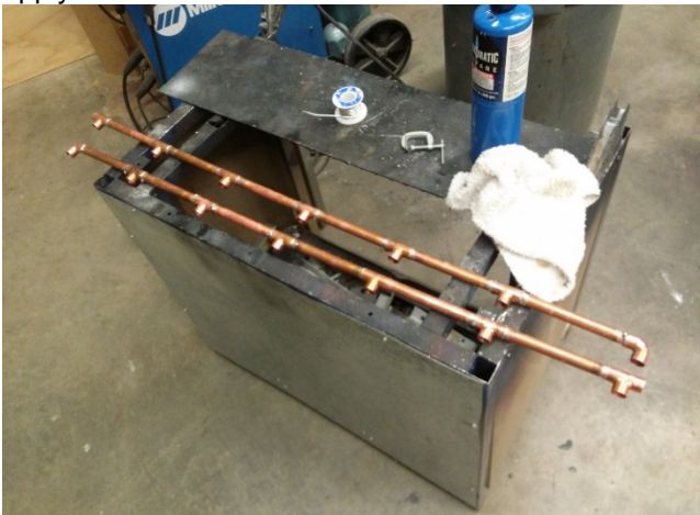
Figure 2: The Tee fittings

Building the copper array in this fashion forms a water channel where at one lower corner water flows in and at the opposite top corner water exits. By having the risers structured in this manner, water should flow up at equal rates and have a chance to be heated substantially. Before soldering the frame together, the fittings and the copper tubes were cleaned with sand paper. Then, solder flux was applied inside the Tees and outside of the copper tubes before doing the sweating. Heat the joint past the solder's melting point with a blow torch and then apply the solder.