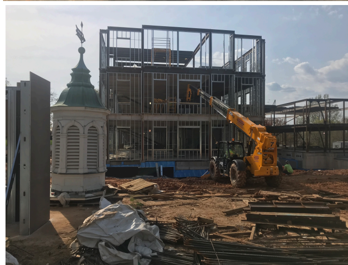
Out With the Old, In With the New: The cupola of the former Bagby Hall stands next to the construction on the new Pauley Science Center which is being built on Bagby's old footprint.

The pictures on the left show the substantial progress made on the new Pauley Science Center as of April 2021. The new Center, standing on the site of the former Bagby Hall, is expected to open in the spring of 2022. The building will house several new features, including a full vivarium for care of animals involved in science projects, and the Hinton-Baxter-Overcash Immersive Biology Laboratory, a well-equipped, state-of-the-art research space made possible by an anonymous $1 million donation to the College.